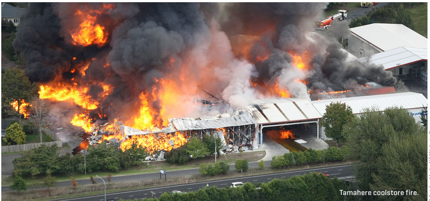
Tamahere coolstore fire.

The impact of this transition has cost, energy and safety implications. Anyone owning, procuring, installing, operating or maintaining cooling/heating systems needs to be aware of these issues to mitigate and control their risk.